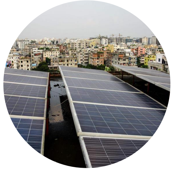
SOLUTIONS THAT LEVERAGE NEW FINANCIAL AND LEGAL MECHANISMS TO CREATE SCALABLE INCENTIVES FOR GLOBAL CHANGE