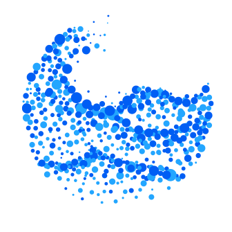
REVIVE OUR OCEANS