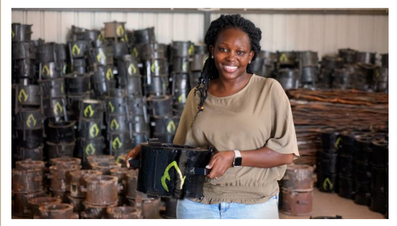
Example: renewable energy and cleaner alternatives to fossil fuels, like <u>AEM Electrolyser</u> and Mukuru Clean Stoves

We primarily seek innovations that can provide an alternative to approaches that cause harm