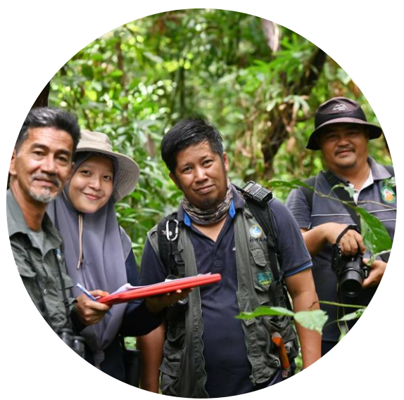
SOLUTIONS THAT PROMOTE SHARED ECONOMIC OPPORTUNITY