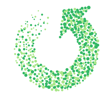
BUILD A WASTE-FREE WORLD