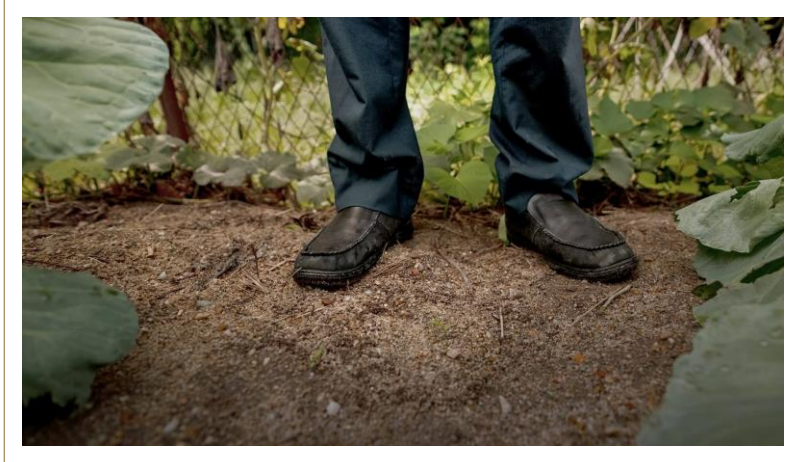
Example: restoring corals like <u>Coral Vita</u>, or regenerating barren landscapes like <u>Desert</u> <u>Agricultural Transformation</u>

We want to make systems we use today better. In this, we seek innovations that are regenerative or restorative